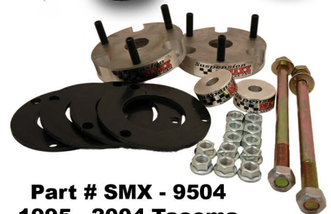
Part # SMX - 9504 1995 - 2004 Tacoma