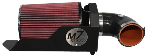
Pleated Filter Shown

M7 Speed engineers and manufactures the highest quality and best fitting Mini Cooper accessories and performance parts available anywhere on Planet Earth! Please inspect your parts when you receive them to verify everything is included and no damage has happened during shipment. Read these instructions completely BEFORE attempting to install this product. If you are not confident you can do the work described or do not have the tools or skills necessary please contact a local M7 dealer (listed on our website www.m7speed.com ) or a local automotive accessory installation center to perform this work. We acknowledge not everything is perfect but we work very hard every day to improve our products and make installations easier. If you have any comments please contact M7 Customer Service directly at 704-663-0094. We encourage and welcome all criticism. Thank you.