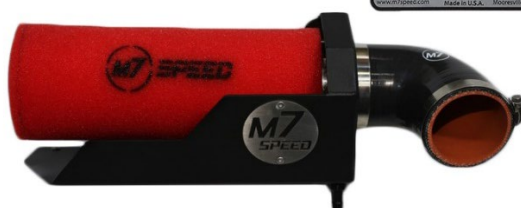
Foam Filter Shown