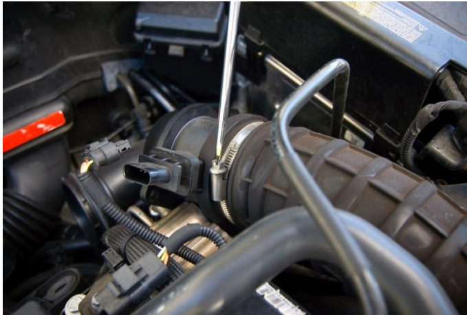
MAF Sensor Clamp